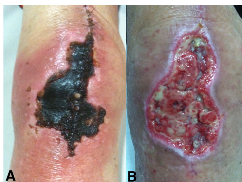
Figure 1. (A) Lesion Covered by Necrotic Crust. (B) Lesion After the Removal of Necrotic Crust.