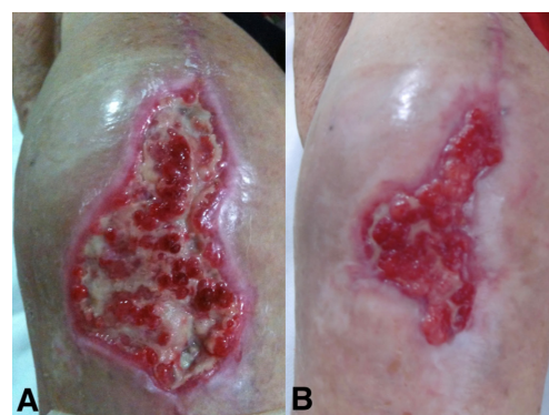
Figure 2. (A) Initial Granulation. (B) Granulation Occupies Almost the Entire Lesion.

Recently, high-power lasers have been used in an unfocused manner or at a lower intensity than those used in cutting or coagulation to achieve the same biomodulatory effects of low-power lasers. Peat et al 11 conducted a study on the effects of in vitro photobiomodulation with high-power lasers on the viability and cytokine expression of bone marrow-derived mesenchymal stem cells. They concluded that high-power laser photobiomodulation of these mesenchymal stem cells produces an anti-inflammatory effect and thus improves the therapeutic properties of these cells for musculoskeletal disease